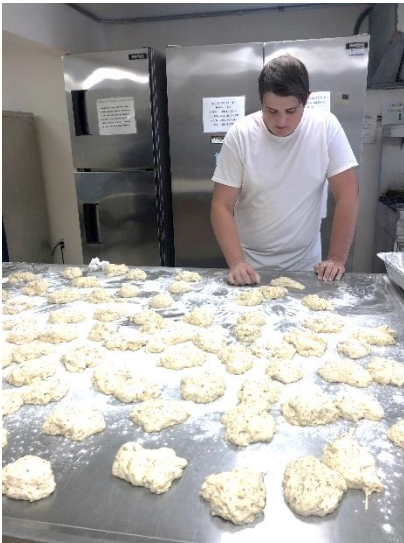
Kody's Homemade Rolls