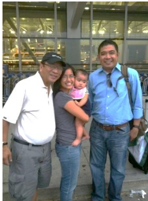
Pageantry of the Religious Celebration of Our Lady of Penafrancia (The Blessed Mother Mary), Patron Saint of Philippines, in Naga City