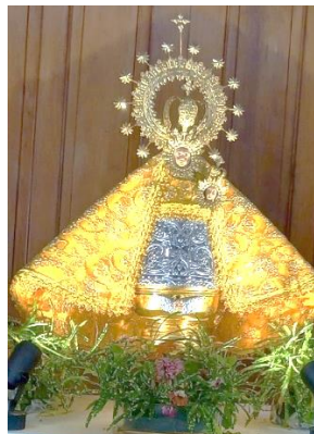
Our Lady of Penafrancia – a 300-year old statue!