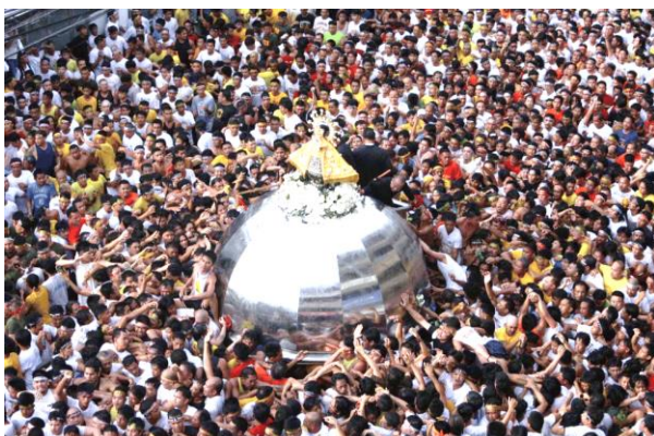
Statue Processing through the Streets Where some 5 million people visit a city of 200,000 in largest Marian pilgrimage in Asia and Philippines.