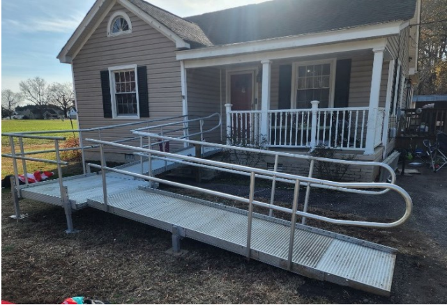
The Knights relocated a handicapped ramp to Billy Fudella’s home to allow access for his mother-in-law.